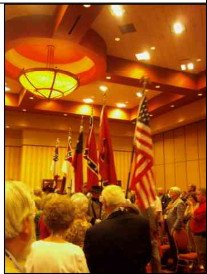
The Colors are posted!