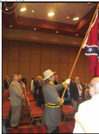
I am their flag!