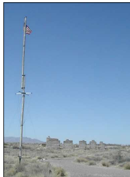
Views of Fort Craig

The Rebel Yell is the official newsletter of the Arizona Division of the Sons of Confederate Veterans. The opinions expressed herein are those of the author(s) and do not represent an official position of the SCV, the Arizona Division or any SCV Camp except where noted. Articles and pictures may be used by any SCV or UDC publication with written permission of the Division Commander. The Arizona Division flag and logo are registered trademarks and may not be used without written permission of the Division Commander.